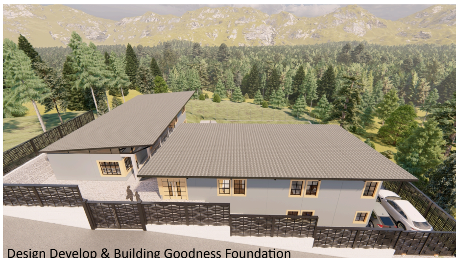
Design Develop & Building Goodness Foundation